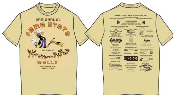
2008 FBMA Rally T-Shirts