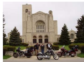
Florida Riders at Mooseheart