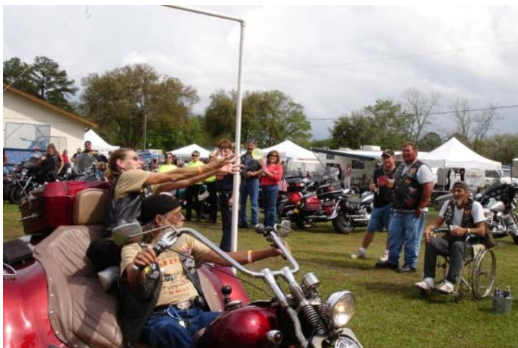
Saturday afternoon games kept riders entertained before the rains came.

This year, on Friday, April 4 th , bikes representing 12 districts in the state of Florida and one from South Carolina started riding into Macclenny. On