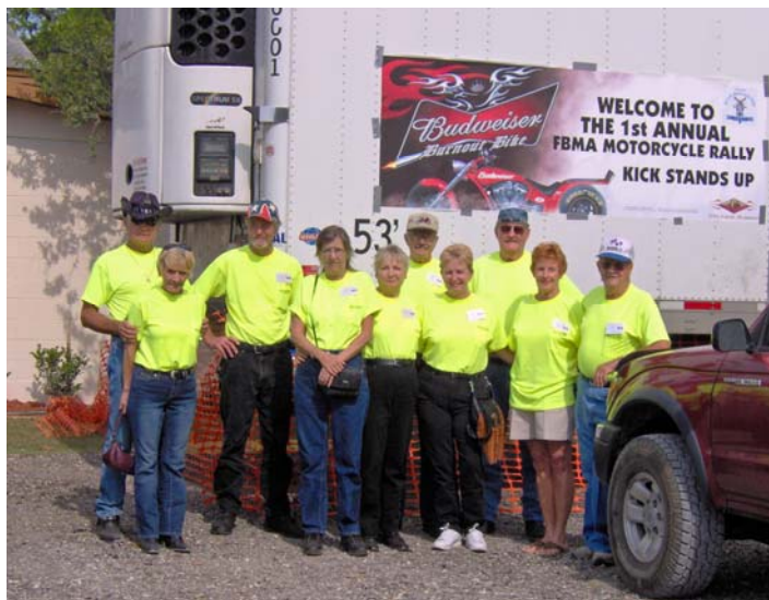
District 12 Moose Riders at 1 st Annual Moose Riders Rally in 2007