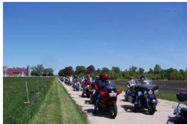
Bikes leaving Mooseheart for Poker Run

The weather cooperated through Georgia, but the rains started as they climbed Mount Eagle and down into the Tennessee Valley. After a night at the Murfreesboro, TN, lodge, kick stands